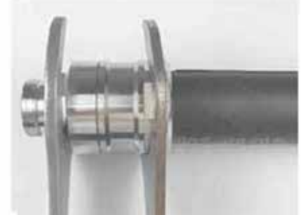
8. Keep main shell body stopped, turn back DOS shell to tighten main shell body.