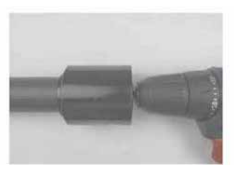
2. Using special knife resects superfluous length of the cable.