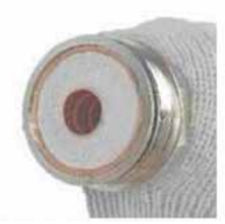
6. Evenly flaring the cable copper skin on the cable clamp.