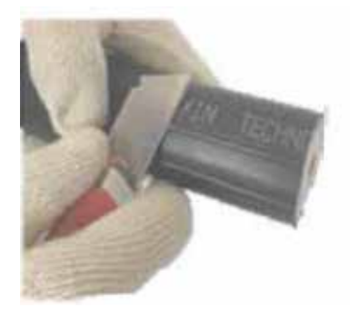
I.Peel the leaky cable mark line at least 60mm.