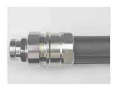
7. Fix front DOS Shell on cable.