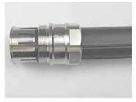
5. Fix back DOS Shell and cable clamp on cable.